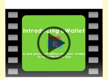
Watch this clip to learn more about the e-wallet.

Our book fair will offer a cash-free payment option called eWallet. It's a convenient digital account that your child can use for shopping at our fair. Grandparents, friends, and others can contribute too! Set up your eWallet <u>HERE</u>.